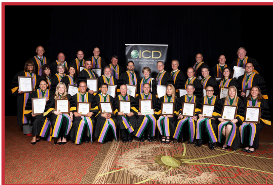
2016 Texas ICD New Members

The annual breakfast meeting at SWDC in Dallas is scheduled for Saturday, September 16 at the Omni Hotel at 7 am.